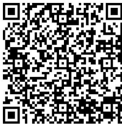
(Android QR Code)